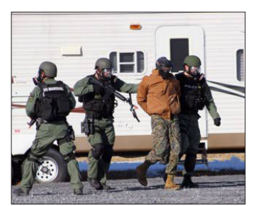
The U.S. Marshals Service is the oldest federal law enforcement agency. Marshals provide court security, hunt fugitives, and offer witness protection.