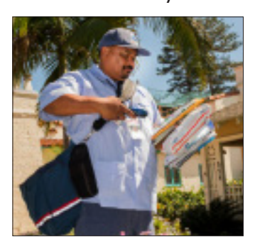
A U.S. Postal Service employee works hard to deliver your mail.

Remember that most of the day-to-day activity in the executive branch involves ordinary people doing the work that needs to be done: an FBI agent conducts an investigation, a soldier participates in training exercises, or a worker monitors a nuclear reactor at an energy plant. The executive branch needs people to answer phones, program computers, file papers, do scientific research, process mail, fly airplanes, and clean bathrooms. In fact, the federal government is the nation's largest employer, and most of those jobs are in the executive branch.