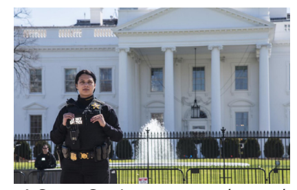
A Secret Service agent stands guard outside the White House.

We depend on many parts of the executive branch to keep us safe and to keep order. For example, the Department of Homeland Security (DHS) is responsible for protecting the United States against all kinds of threats. It includes agencies that deal with terrorism, natural disasters, and border protection. It also includes the Secret Service, whose agents protect the president and vice president and their families. Inside the DHS, the Federal Emergency Management Agency (FEMA) responds to natural disasters to help people get the help they need in an orderly way. The Coast Guard, also part of DHS, patrols our nation's coastlines to watch for threats and helps boats in distress.